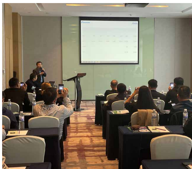
Seminar participants in Shanghai listened to a wide range of presentations

The Daikin team also talked through case studies of several new shipments of perishables that were supported by Daikin Active CA, together with outlining unique and innovative CA strategic developments. The seminar attendees really benefited from meeting in-person after a long period of business travel restrictions due to the pandemic.