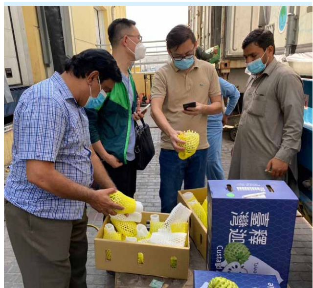
Custard apples shipped with Daikin Active CA arrive at Jebel Ali port in Dubai