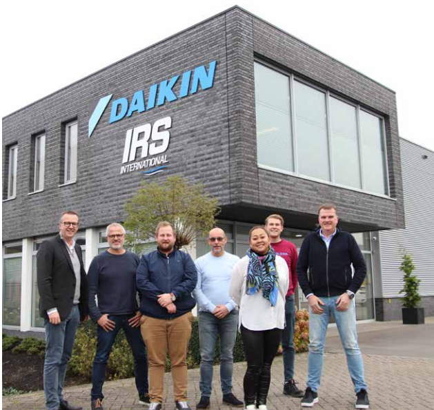
The Daikin and IRS team outside the new office

Westbaan 324 2841 MC Moordrecht The Netherlands